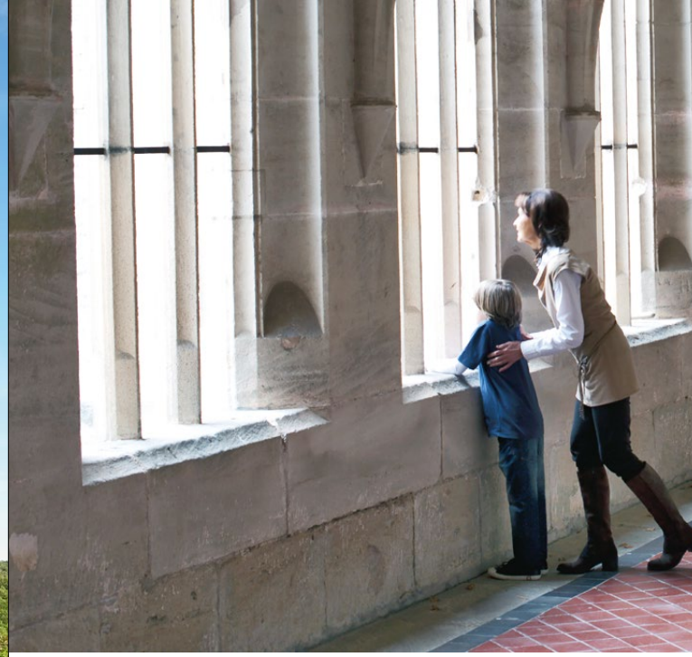
The cloister was the centerpiece of the monastery