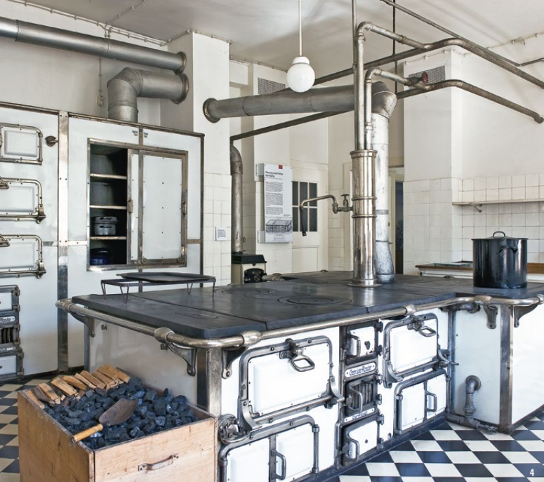
1 to The kitchen, built for the last royals of Württemberg, remains intact

The 19th century interiors, inspired by the Gothic and Renaissance styles, make Bebenhausen an important architectural heritage site. But the Green Room has a distinct Art Nouveau character. After Württemberg ceased to be a monarchy in 1918, the royal couple, Wilhelm II and Charlotte, were given the right to remain in Bebenhausen for the remainder of their lives. The royal bathroom and kitchen are well worth seeing: The luxurious bathroom, dating from 1915 , is unusually well preserved. The kitchen also represented the height of modernity when it was installed in 1915—and it remains in its original state until today.