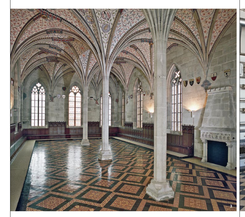
The summer refectory, where the monks dined in the warmer seasons, illustrates Gothic architecture at its most elegant