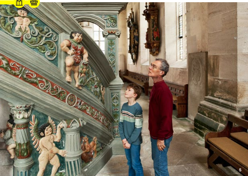
The unusual pulpit in the monastery church tells many colourful stories