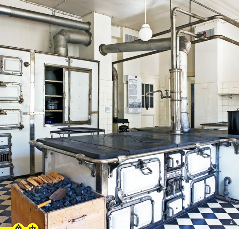
The kitchen, built for the last royals of Württemberg, remains intact